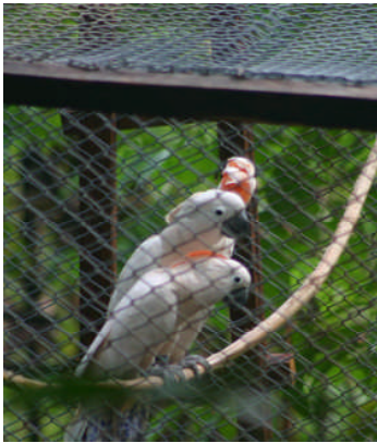
Photo above: These Umbrella cockatoos are new arrivals at Kembali Bebas.

The Rehabilitation Center KEMBALI BEBAS on Seram Island, Indonesia currently is the home to over 120 cockatoos, parrots and lorries. Most are wild psittacines confiscated by the Indonesian authorities from smugglers and trappers and turned over to us for care. Each bird is carefully assessed, given medical care and rehabilitated if possible. Some birds can be released back into the wild; some will be given sanctuary for life in our center, especially those who have sustained major injuries.