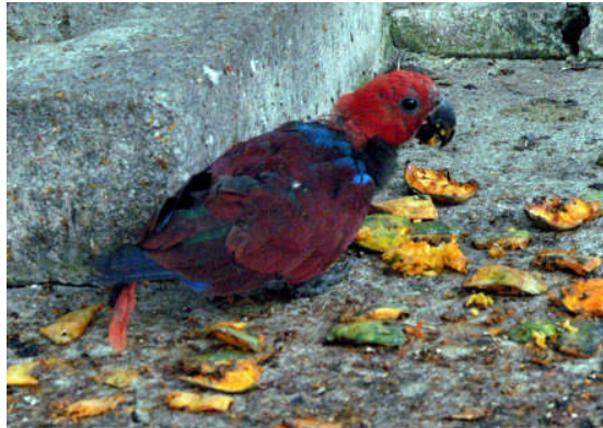
Photo left: shows a female Eclectus starving to death after confiscation from smugglers; the Photo right: shows marked improvement in feathering after her first eleven months at Kembali Bebas.

These Moluccan cockatoos Photos left are some of the lucky ones. Trapped on Seram and confiscated before they were smuggled off the island, they still retained their wildness and fear of humans. Following testing for disease and rehabilitation, they were released back into their forest home in March, 2006.